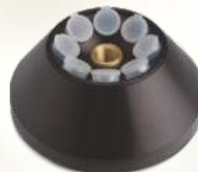
R-247 M (8 x 50 ml)