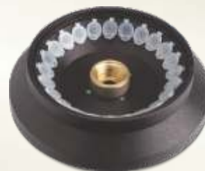
R-248 M (24 x 1.5 ml)