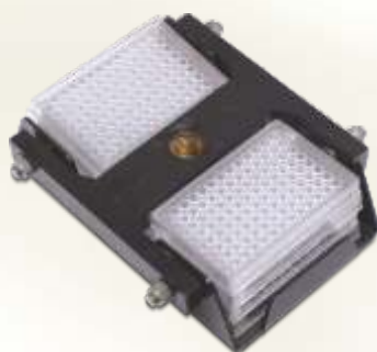
R-235 M (8 X MICROTITOR)