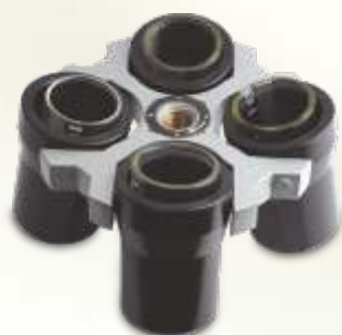
R-230 M + R-231 M (4 x 200 ml)